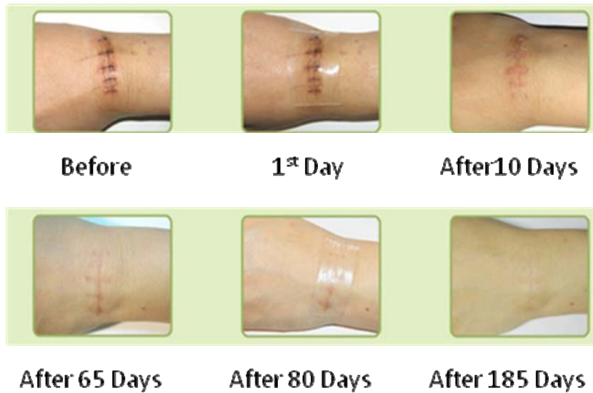
Fig. 2 Pictures of clinical test result

Female/Surgical Wound/Period: 2008.11.25-2009.06.01